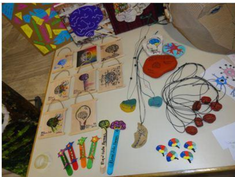
Constructions, made by Student volunteers