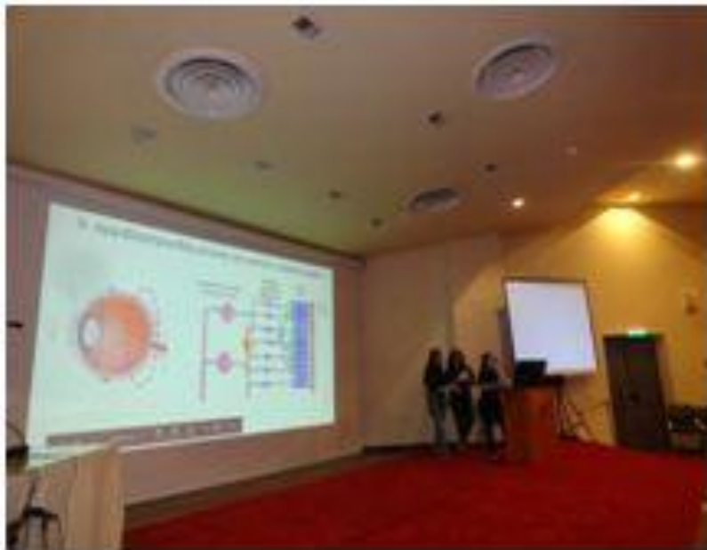
6) The house of the soul. A video presentation about the structure and functions of the brain ( 12 th Lyceum of the city of Patras)