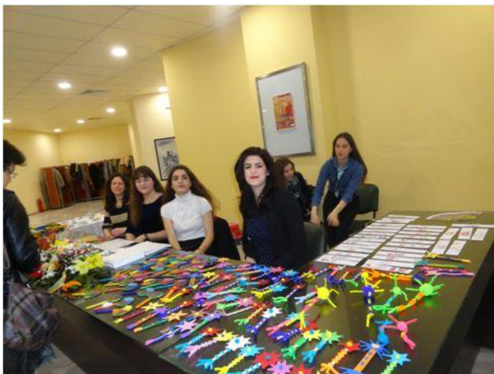
A view of the Secretariat