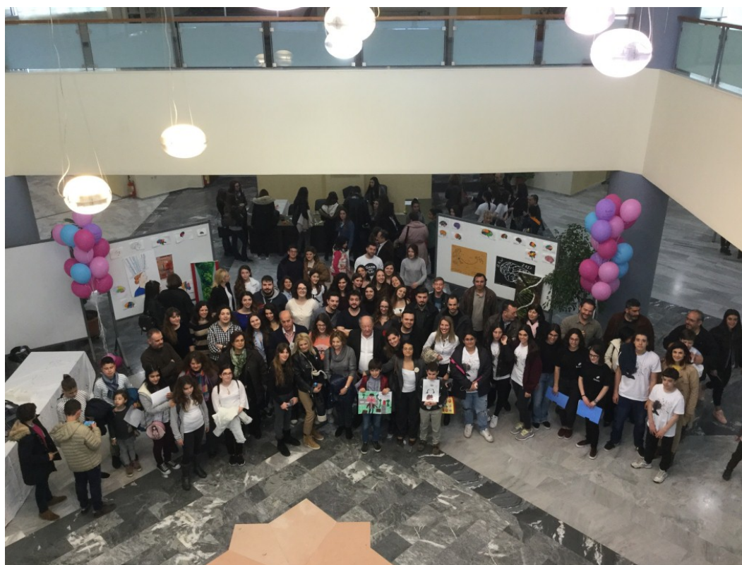
A memorial photo at the end of the meeting